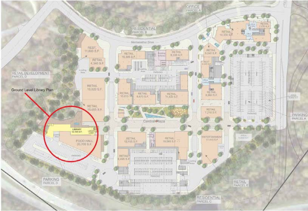
Exhibit C-2 - New Central Library Site Ground Level Plan

Ground Level - PHASE 1 Scale: 1" = 120'-0"