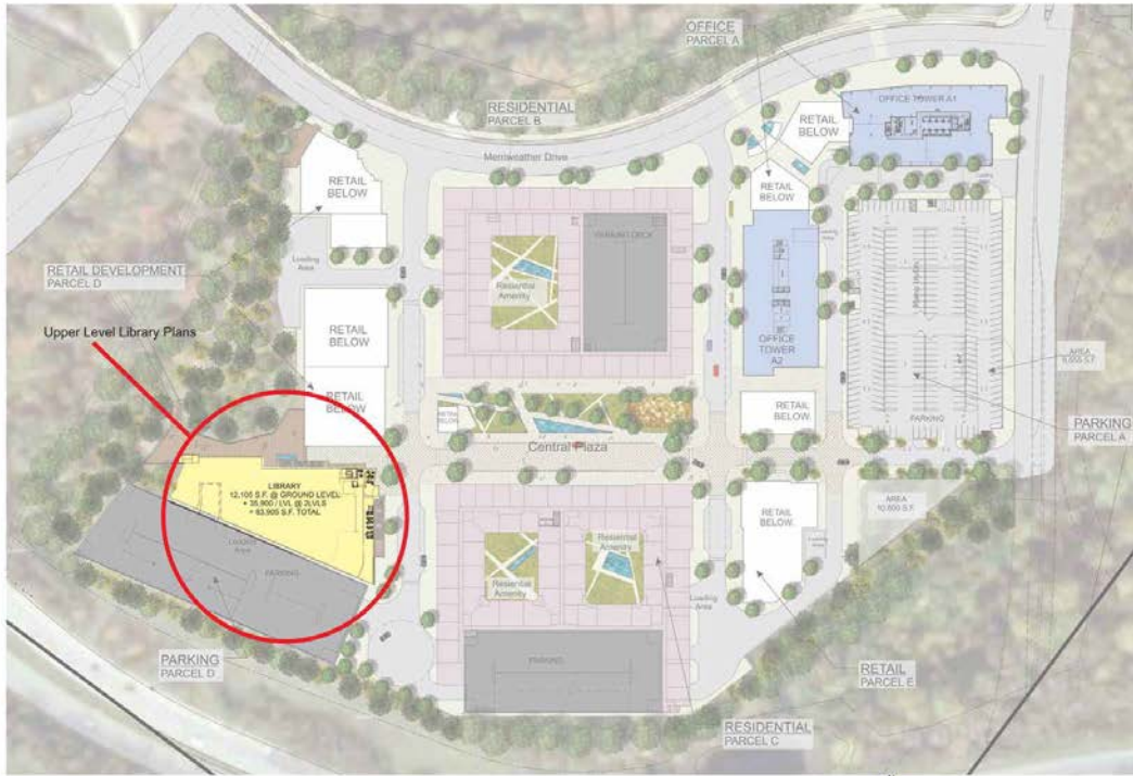
Exhibit C-3 - New Central Library Site Upper Level Plans

Upper Level - PHASE 1 Scale: 1" = 120'-0"