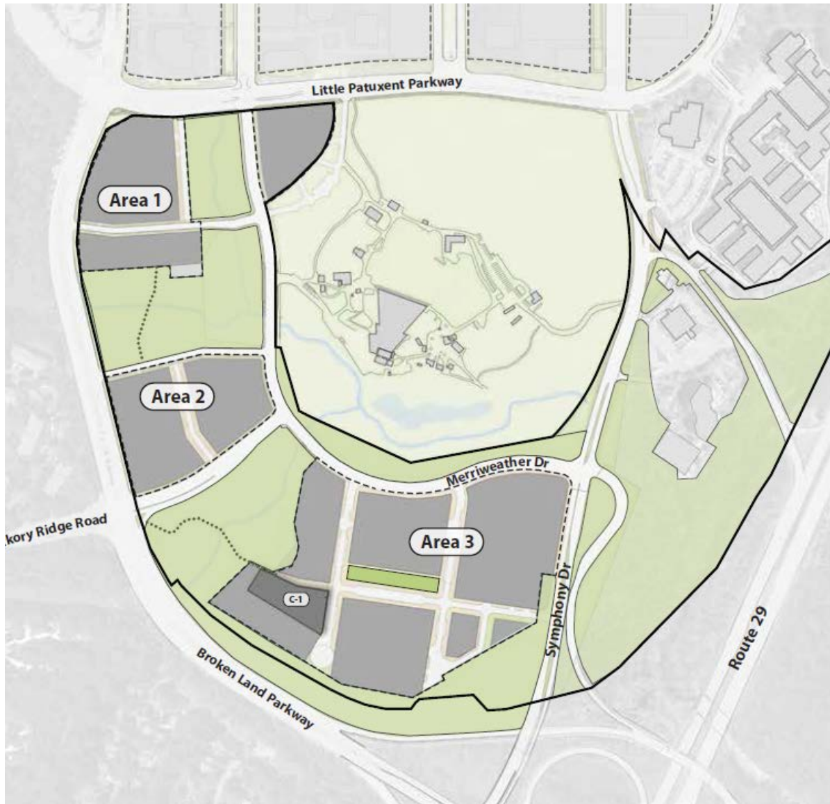
Parcel C-1: New Central Library Site