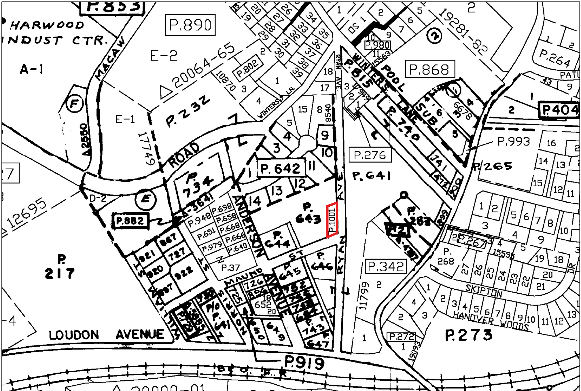
Anderson Cemetery 2012 Cemetery Updates Tax Map 38, Parcel 1001