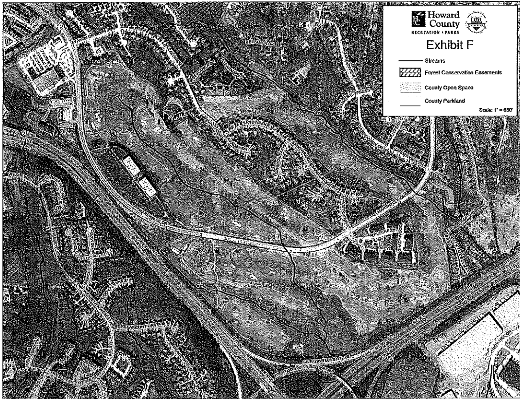
EXHIBIT F FOREST CONSERVATION AREAS