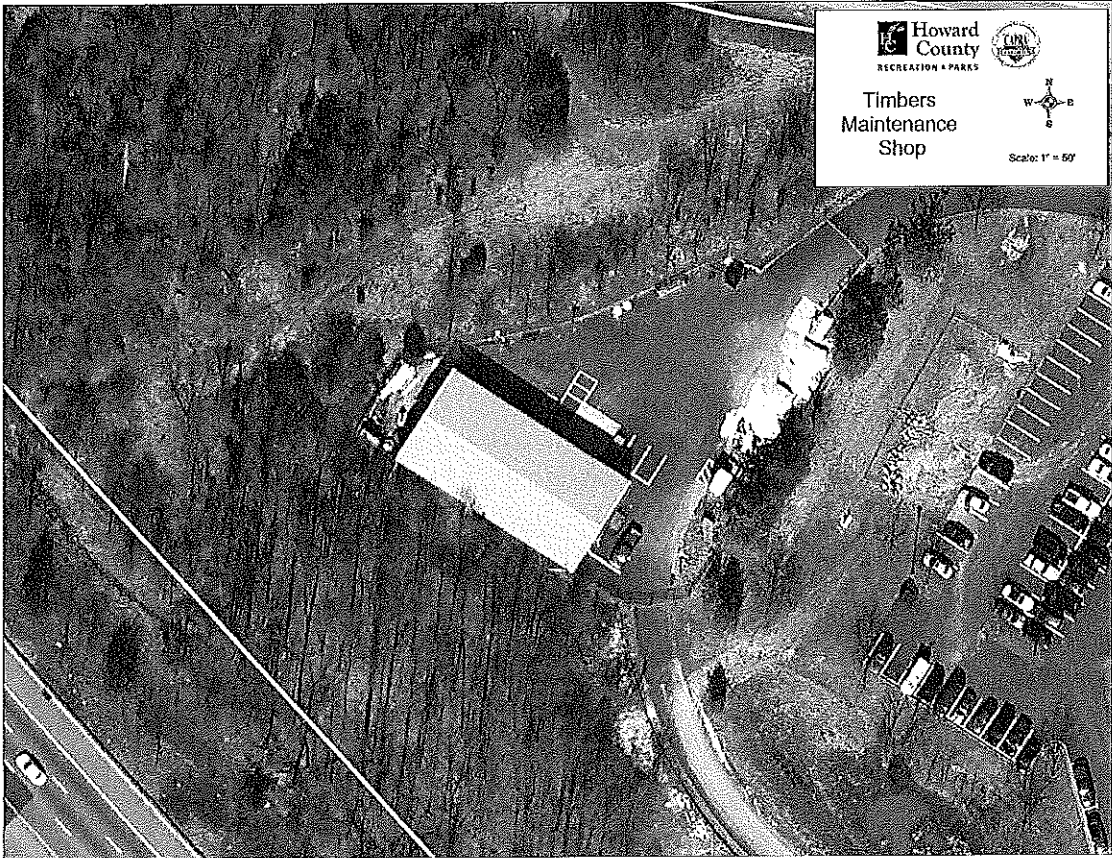
EXHIBIT C TIMBERS MAINTENANCE FACILITY