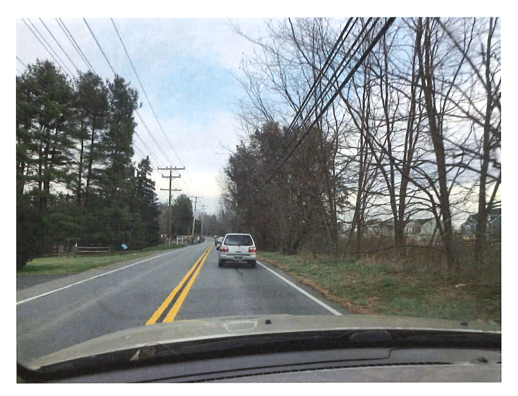
Another section of Clarksville Pike.