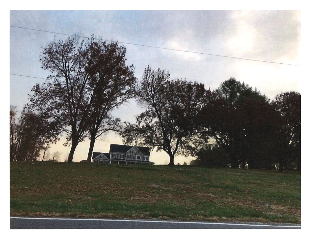
New house built on the knoll in the background along Old Frederick Road.