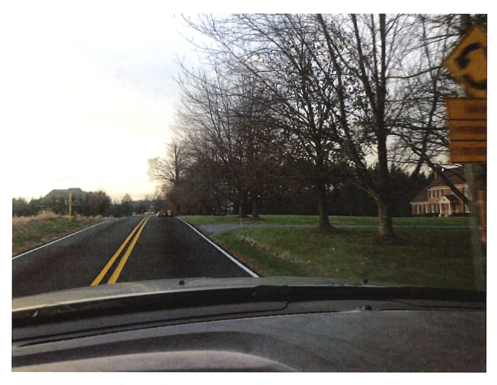
Single line of trees along Pfefferkorn Road (scenic road)