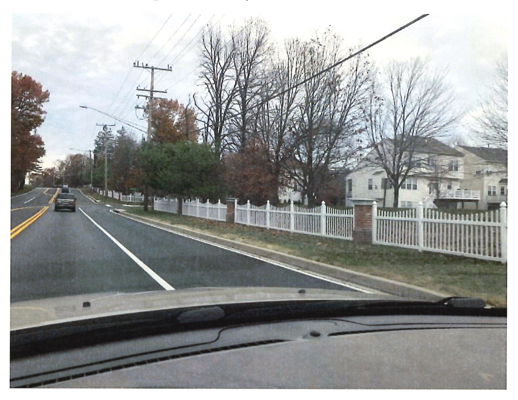
Fence and lines of trees along Frederick Road