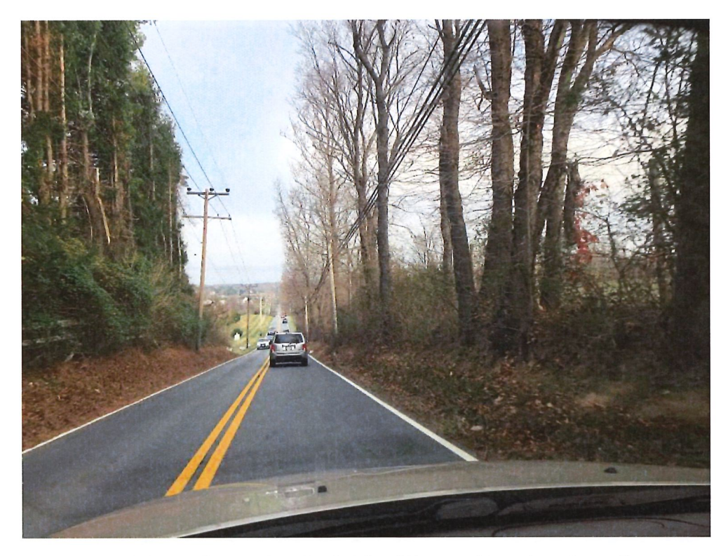
Single lines of trees along both side of Sheppard Lane (scenic road).