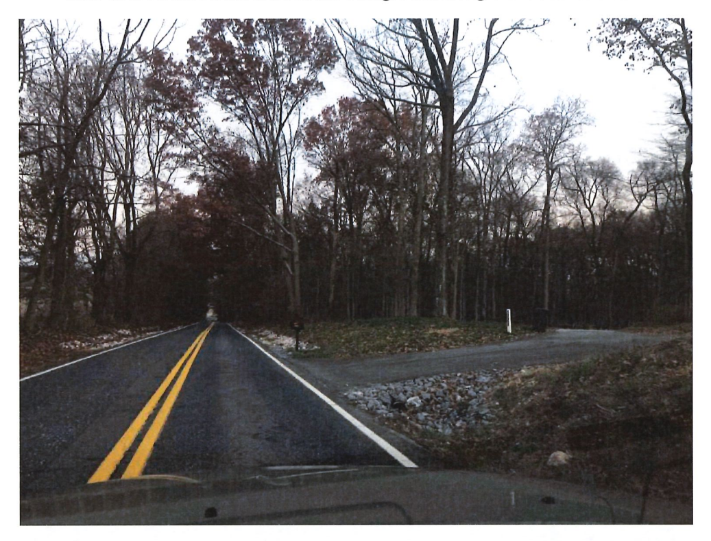
Near the new driveway entrance is a scenic roads buffer that starts out about 40 foot in width and varies along Old Frederick Road (scenic road section).