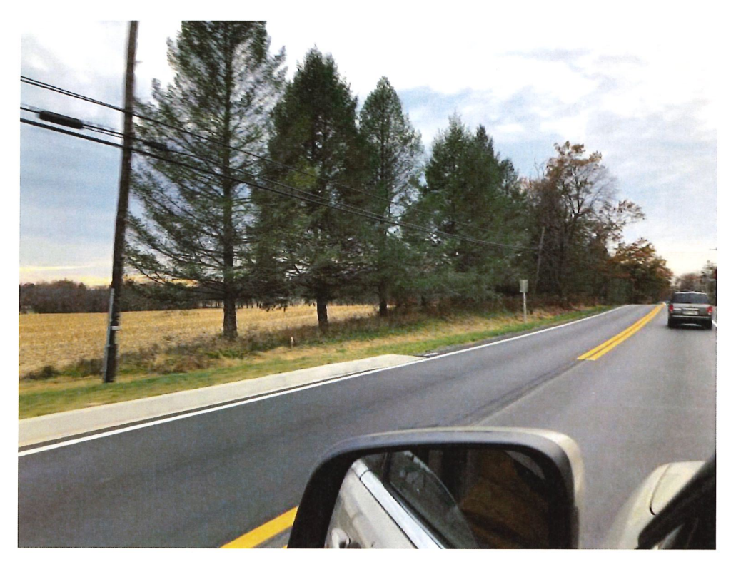
Single line of trees provide visual character