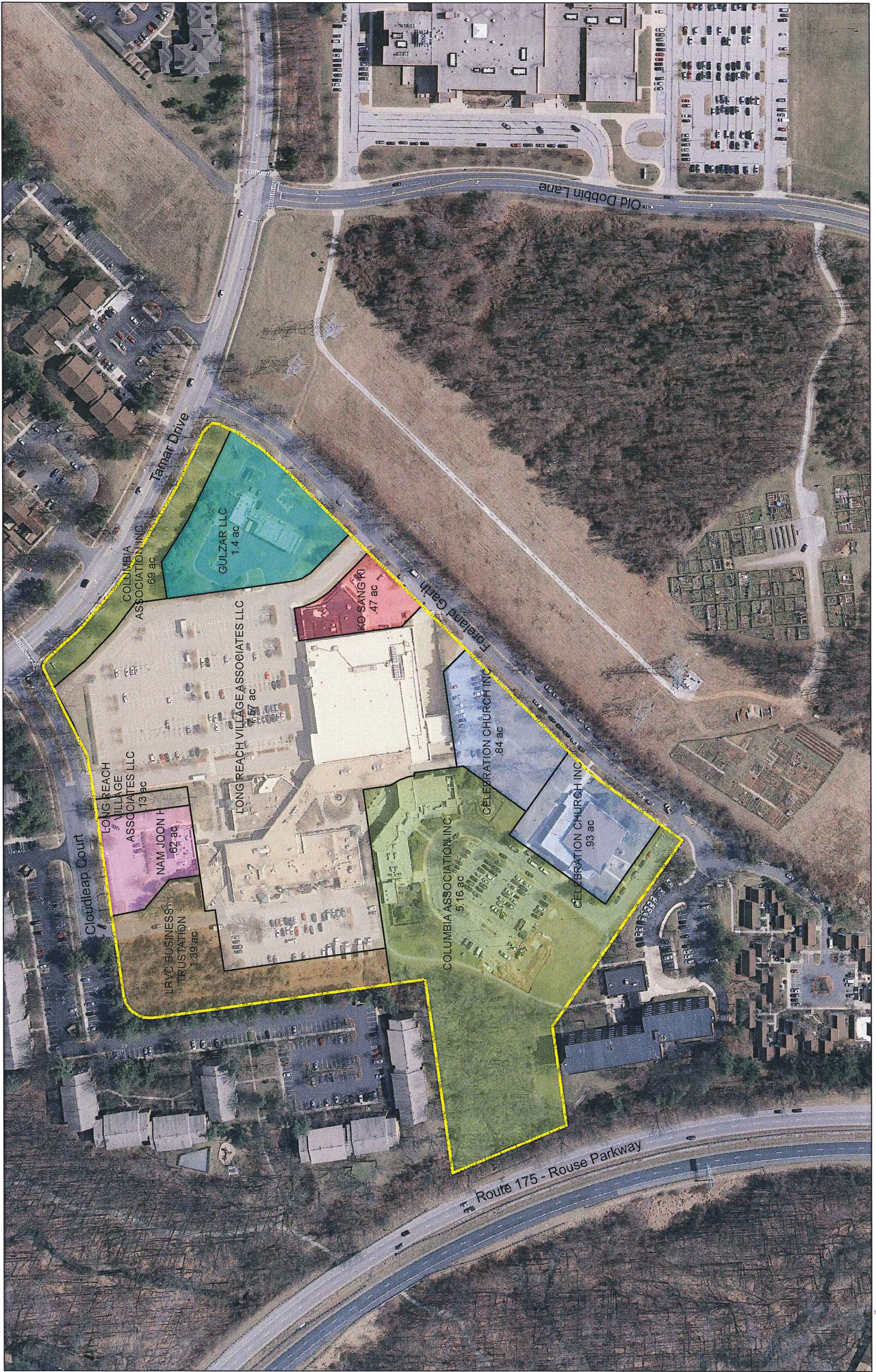
Long Reach Village Center - Exhibit B