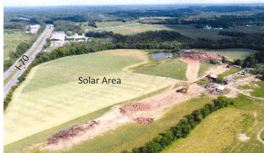
Friendship Project location