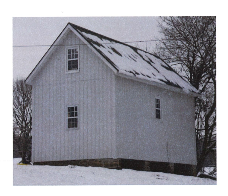
1 | Page