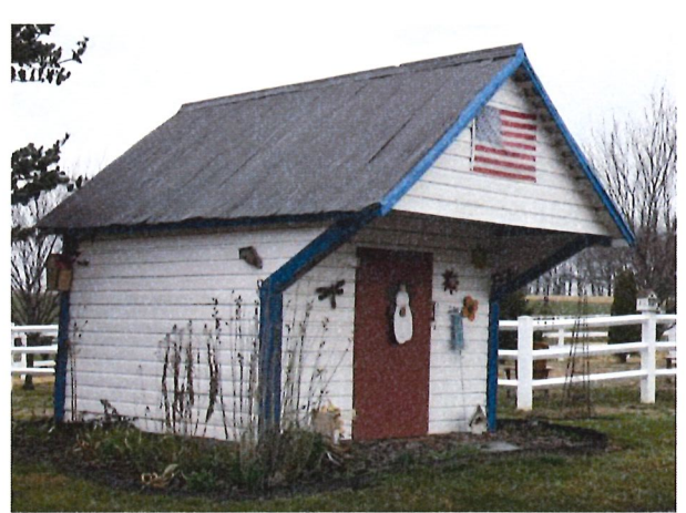
5 | Page