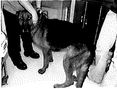
Photo taken day he was removed from Animal Welfare Society