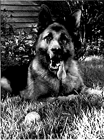
Tigger - a much healthy, happy dog. August 2020