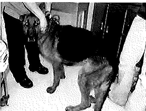
Photo taken day he was removed from Animal Welfare Society

Thank you for the opportunity to let me present my experience on why I feel so strongly about CB1.