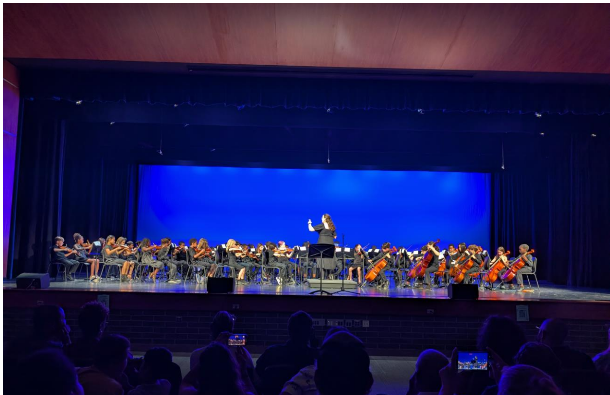
Photo: EES 3 rd grade orchestra, June 3, 2025

Elkridge Elementary School has over 800 students, 135 of them in the current 3 rd grade class. Of these 135 students, 87 of them are in the 3 rd grade orchestra this year (55 violins, 20 violas, and 12 cellos). This is a 64.4% participation rate by students in 3 rd grade strings at an elementary school that is 45% FARMS and only 28% white. In our heavily diverse school with a huge mix of incomes and cultural backgrounds, 3 rd grade strings is extremely valued. So valued that the concert had to be held at the high school and not the elementary cafeteria because the students could not fit on the stage there to perform for their families and still have room for an audience.