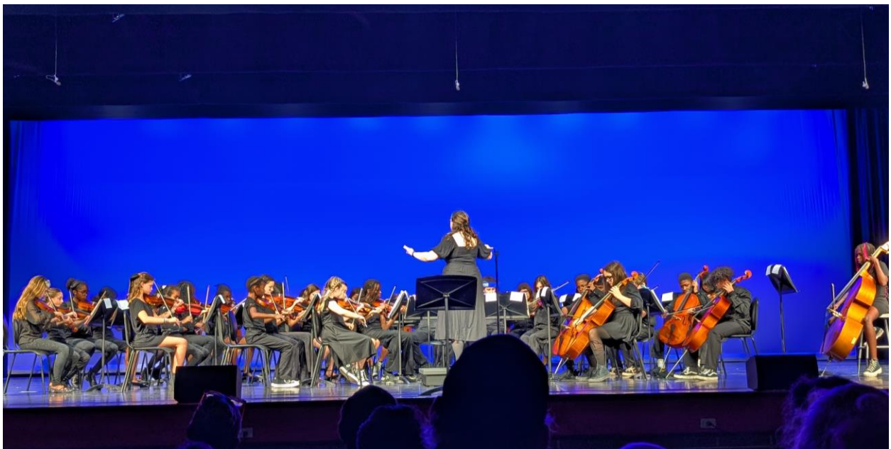
Photo: EES 5 th grade orchestra, June 3, 2025

Elkridge Elementary has 132 students in 5 th grade. The 5 th grade orchestra is similar in size to 4 th grade, with 44 students participating (again, they also have classmates learning band instruments and/or in chorus).