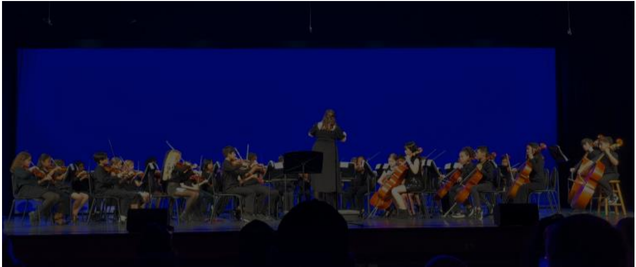
Photo: EES 4 th grade orchestra, June 3, 2025

also had a participation rate of over 60%, though some have now gone on to band and/or chorus instead of orchestra.