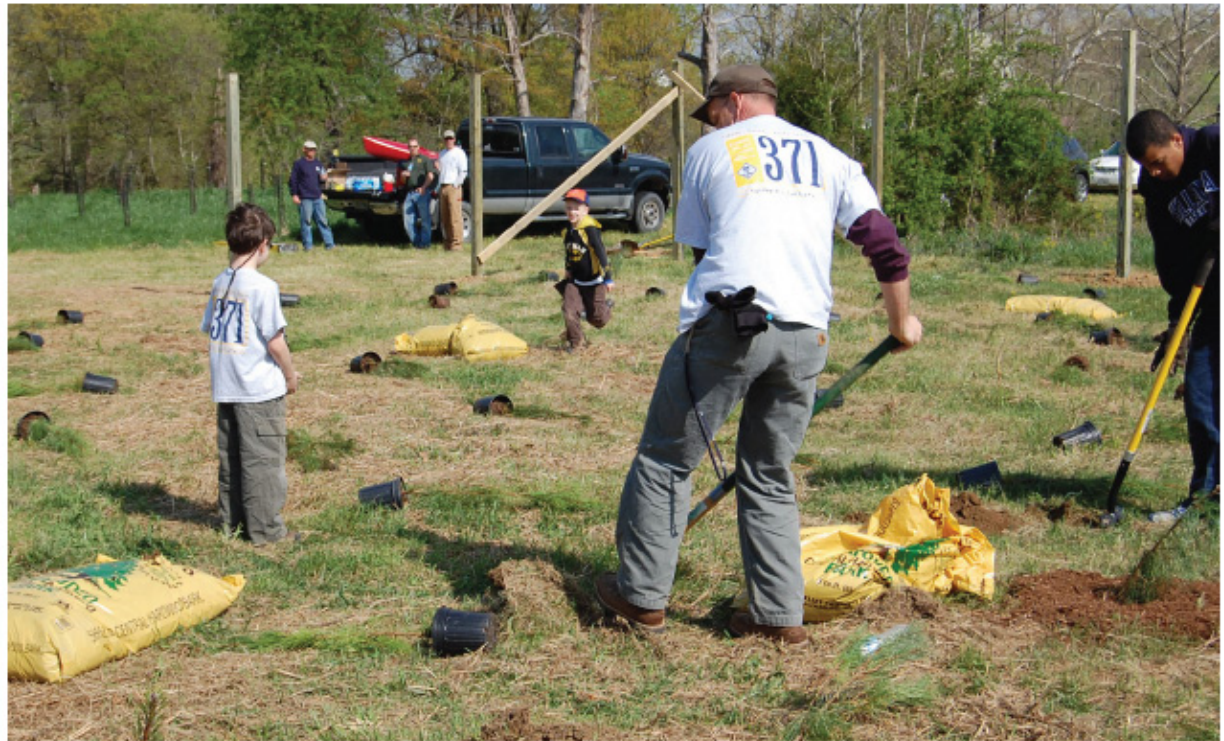
Annual tree plantings are organized by the Department of Recreation and Parks.