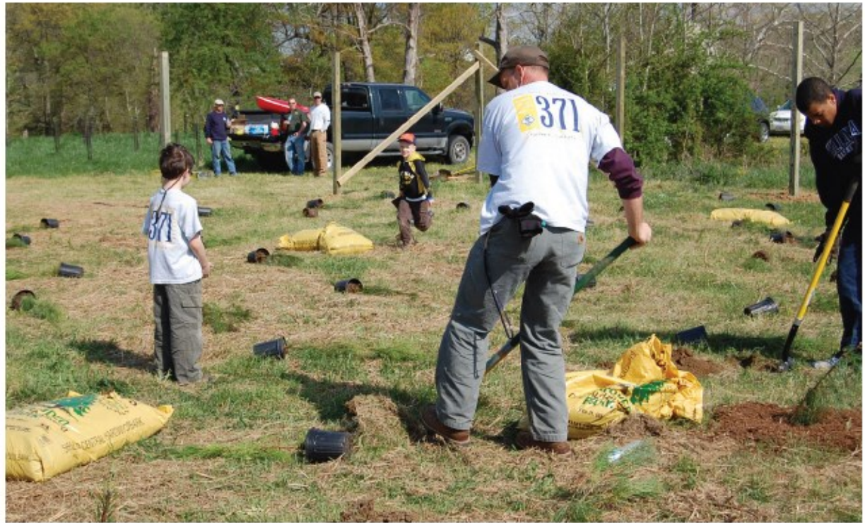
Annual tree plantings are organized by the Department of Recreation and Parks.