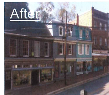
Façade improvement program at work in Ellicott City